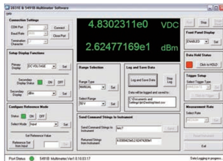
Application software screenshot

The 2831E and 5491B are programmable via USB and RS232 (5491B only) interface using industry standard SCPI commands. Users can control and configure the instrument from a remote PC and retrieve measurement results for further analysis. The meters can also be remotely controlled using application software (downloadable from the B&K website), which supports front panel emulation and data logging of measurement results.